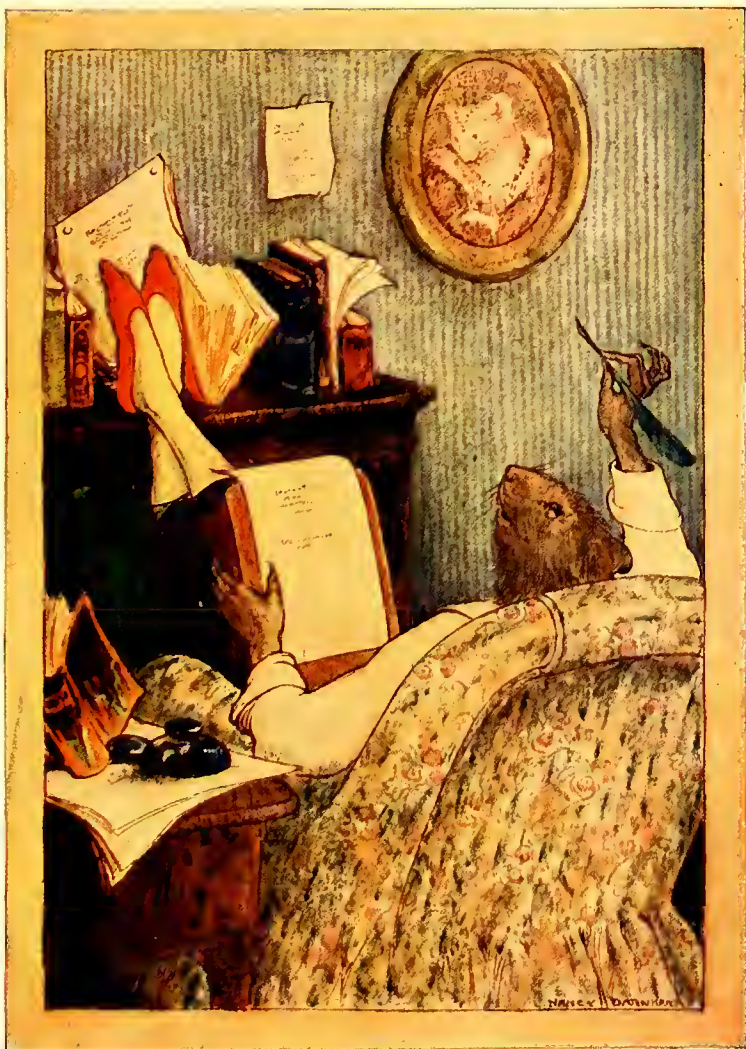
HE SOMETIMES SCRIBBLED POETRY